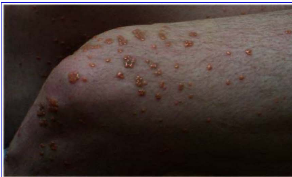
Figure 1. Cutaneous xanthomas of Lipoprotein Lipase Deficiency.